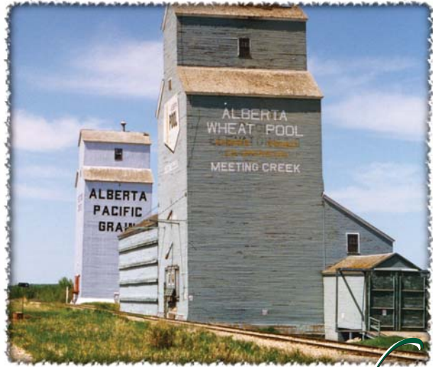
Meeting Creek elevators before restoration work started, 1987.

The Canadian Northern Society, in its 20th anniversary year also recognizes three other grain elevator preservation projects in central Alberta. Through the dedication and efforts of the Big Valley Historical Society, Big Valley's last Alberta Wheat Pool grain elevator, built in the early 1960s, was preserved in 1998. In