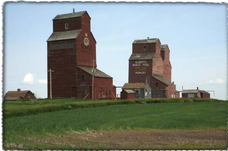
Rowley elevators, 2006.