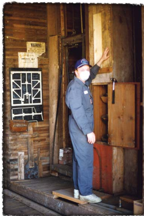
Restoration work started in the Meeting Creek AB Pacific elevator, 1999.