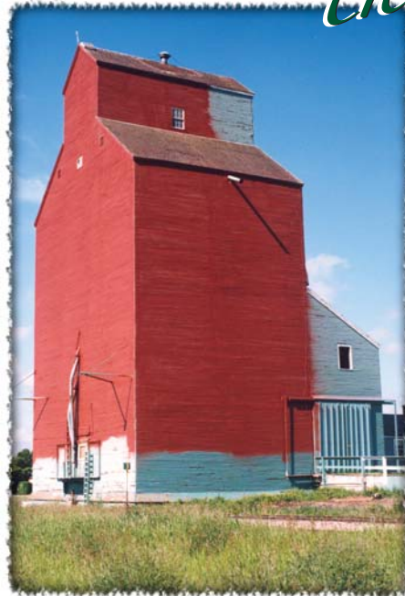
Painting of the Big Valley elevator, June 1999.