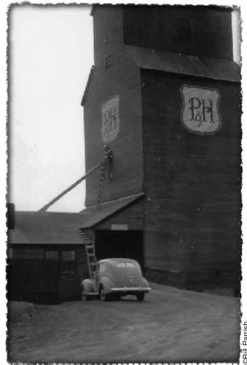
Stettler P&H elevator, c. 1940s.