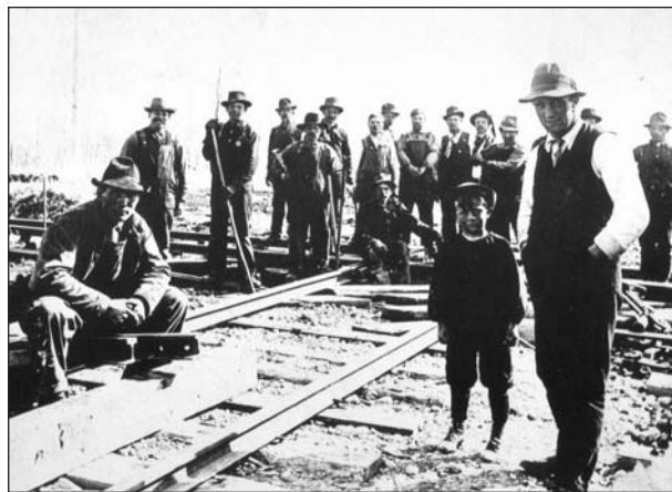
100 years ago, April 23, 1910, the Canadian Northern track laying gangs crossing the CPR Wetaskiwin Sub at the diamond north of the Camrose depot.

I worked out of my Camrose depot “home office” that day and