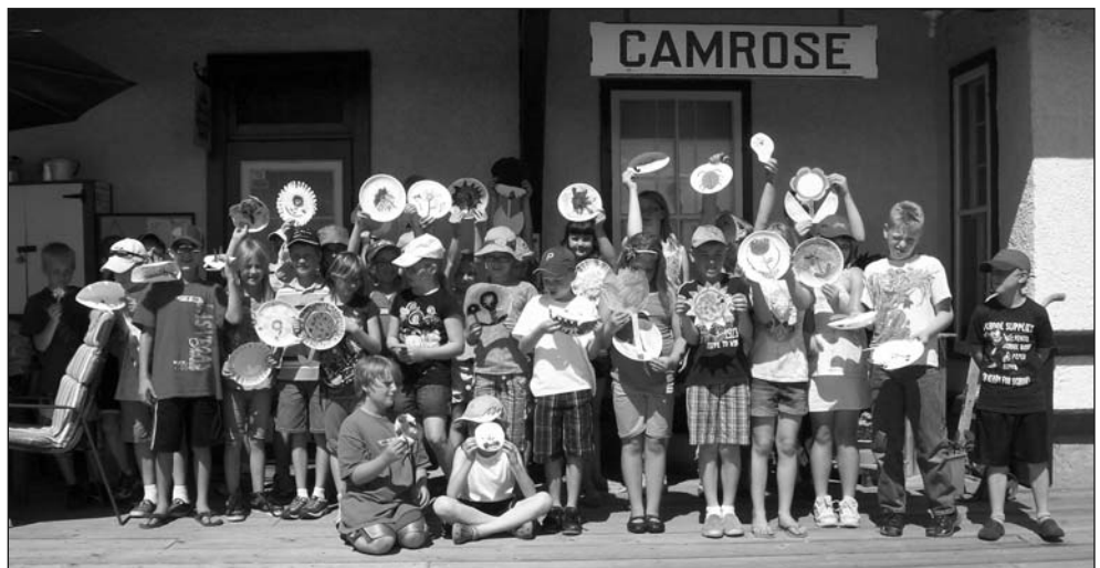
A group of students who attended a recent summer camp day at the station show off their crafts.

Prairie Fun Days is an initiative lead by the Camrose Station in partnership with the Camrose County. We have designed a driving tour with 11 county destinations, including our very own incredible Meeting Creek Railway Station. Pick up a brochure (available at Tourism Information Centres, at the County Office, and at the Camrose Railway Station), and join in—there are many wonderful sites to tour, great food, history and nature to explore.