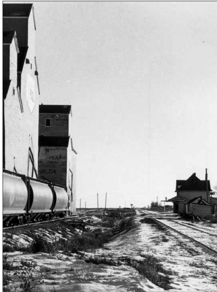
Donalda, AB, Canadian Northern Railway depot, 3rd class plan with elevators, view looking south, December 1980.