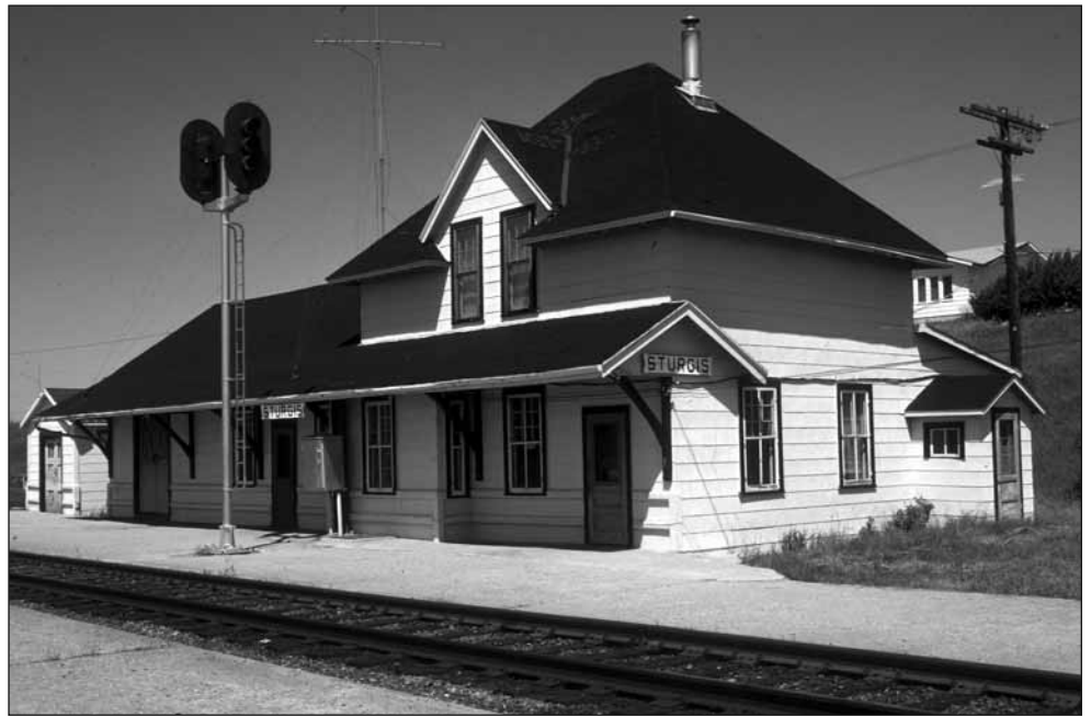
Canadian Northern Railway Third-Class depot at Sturgis, SK. July 1983