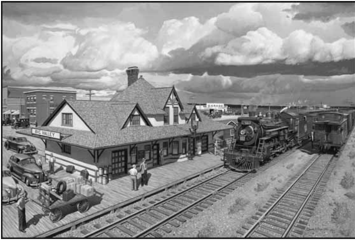
24" x 36", Acrylic on Canvas, 2012 Private Collection