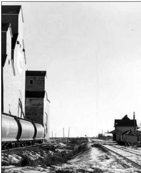
Donalda elevators and station view south, December 1980.

Remnants of the old Canadian Northern exist in the abandoned Battle River Subdivision right of way, north of the 1909 station (Vandura station) where a leisurely walk can be taken to view the beautiful Meeting Creek Valley.