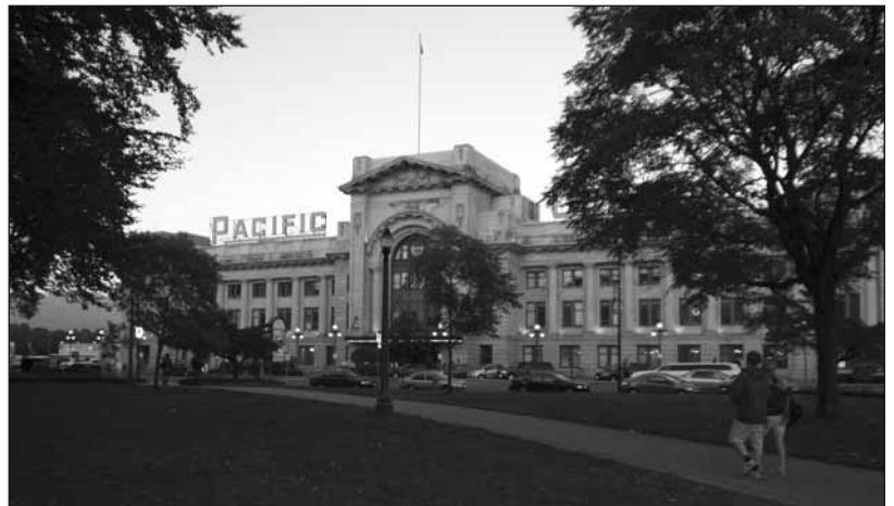
Vancouver Canadian Northern station in 2009.

VIA Rail has completed major renovations to the station, paying strict attention to preserving the heritage features of the building, which was completed in 1919. First, the platform canopies and lighting were improved alongside the tracks where the trains arrive and depart and station columns were repaired. This work was finished in 2010. Then, a full restoration of the Vancouver Station building was undertaken. From top to bottom, the exterior masonry of the building was repointed and cleaned, the roof rebuilt, the exterior windows and doors restored or replaced and the iconic "Pacific Central" sign on the roof stabilized, as well as security improvements made. This second phase was recently completed.