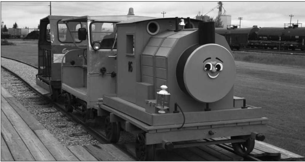
▲ Above: Old “Number 16” stands ready for the children to take a ride at the Camrose Railway Station train day in late July. This event was well-attended by many from all over the Camrose area and Capital region.