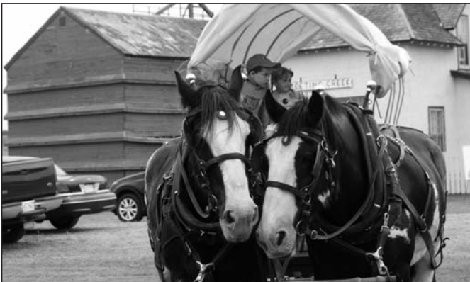
Children enjoy covered wagon rides at the Meeting Creek Prairie Fun Day.