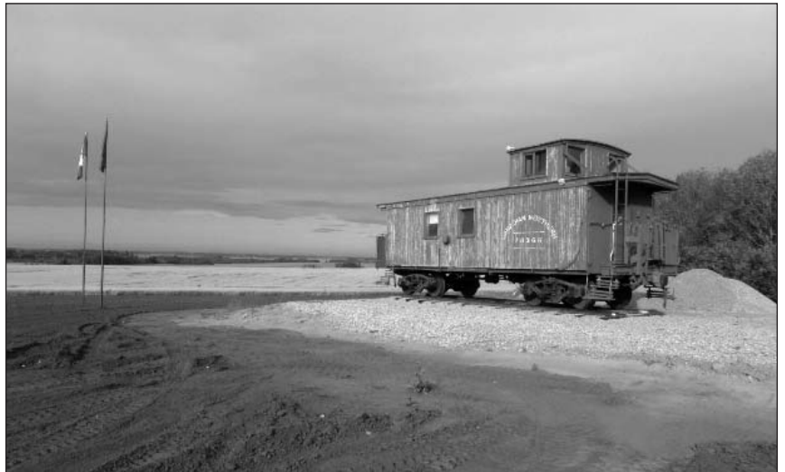
The caboose in its new location with the mountains in the background.