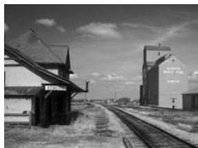
Edberg, Alberta - 1981