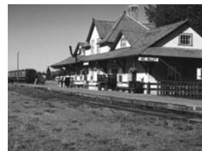
Big Valley, Alberta