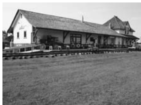
Camrose, Alberta