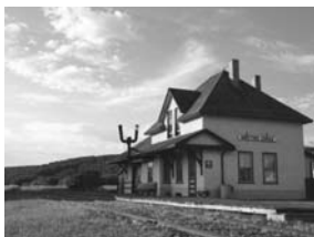
Meeting Creek, Alberta