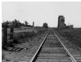
Rowley, Alberta