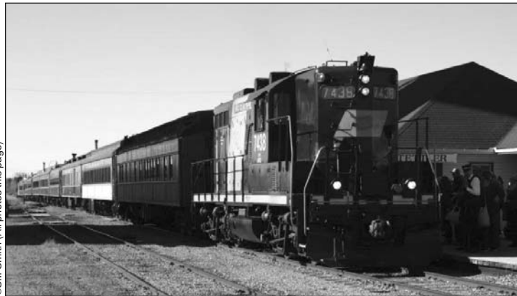
Passengers boarding the train in Stettler.