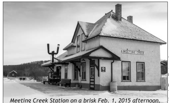
Meeting Creek Station on a brisk Feb. 1, 2015 afternoon.