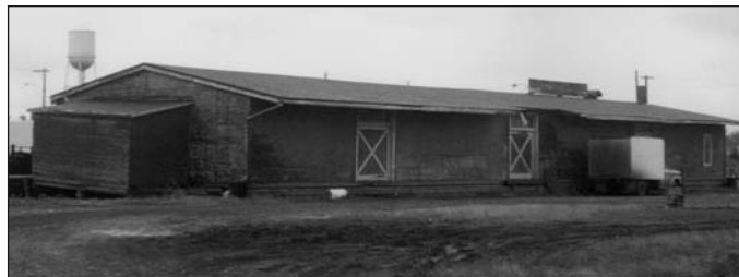
The CNR freight shed in Camrose during its final years.

position of Station Agent (or later Train Dispatcher), the two young men were provided with a telegraph key and sounder plus a copy of the “American Morse Code” to learn this new language of “dots and dashes.” Once mastered, this knowledge of Morse tends to